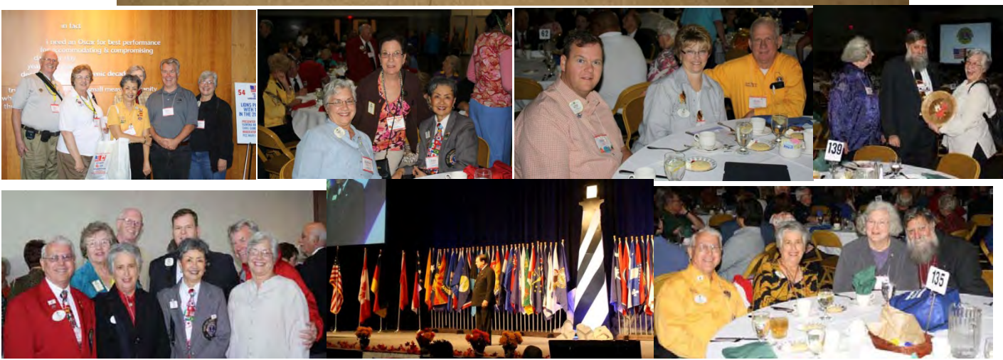
Start planning now to attend the next USA/Canada Forum in Anchorage, Alaska. There will be great seminars to attend and many friends you will meet and/or make new friends. Also, imagine the tours that you will be enjoying if you take a couple more days to explore one of the last frontiers.