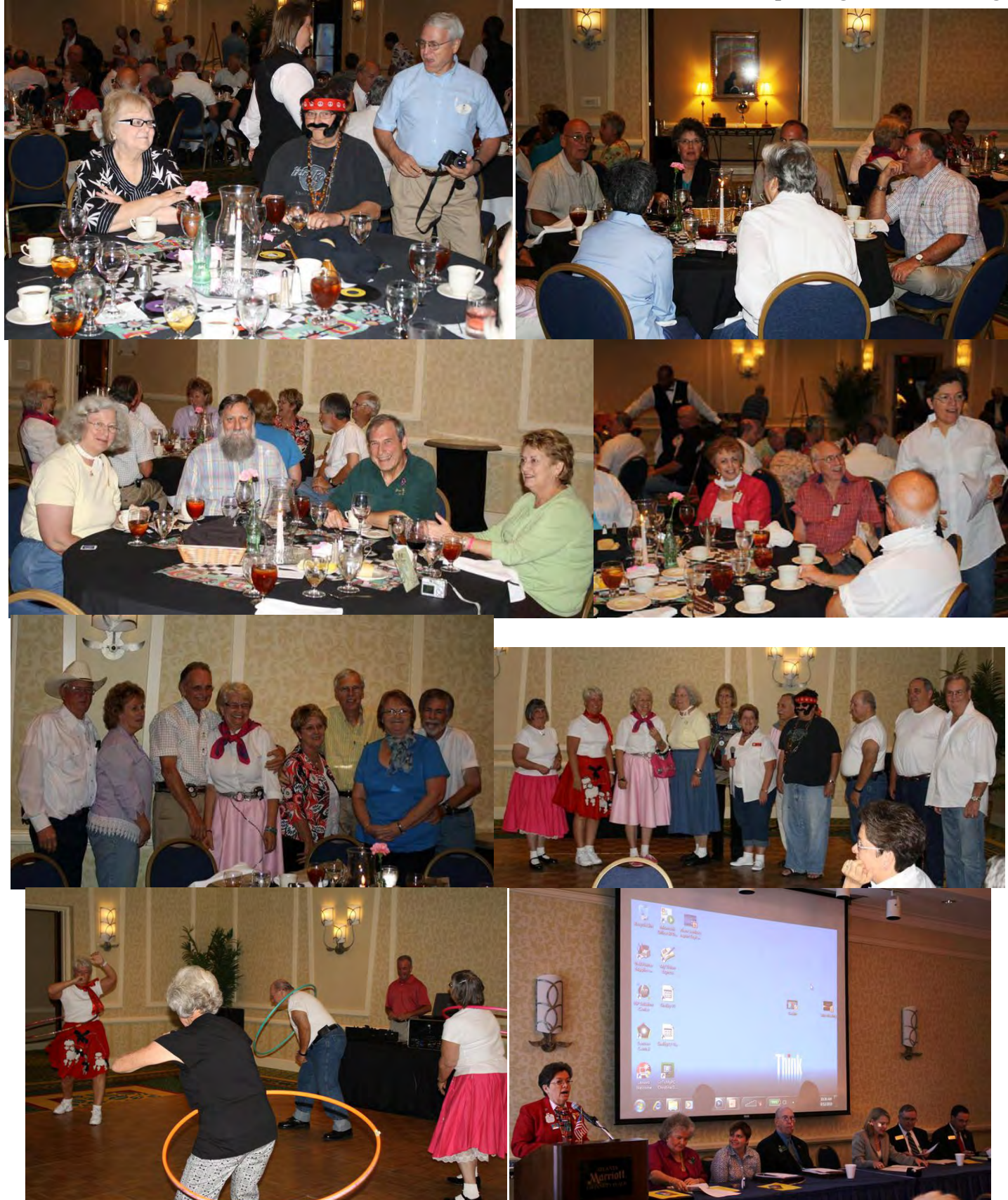
Gee, what did you miss? Next time, you might want to plan ahead and attend a Camp or Lighthouse meeting.