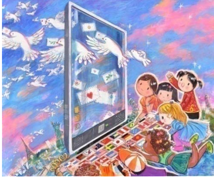
"Peace Begins With Me" 2008-09 Grand Prize Winner

The theme of the 2009-10 Peace Poster Contest is "The Power of Peace." Students, ages 11, 12 or 13 on November 15, are eligible to participate.