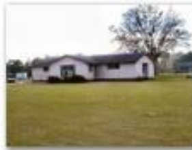
18 Capacity Bunk House