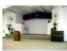
Activity Center Stage