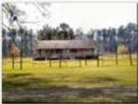
Arts & Crafts Building