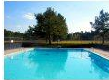
Olympic Swimming Pool