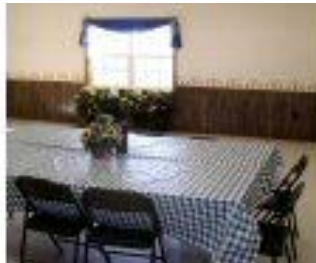
125 Capacity Dining Hall