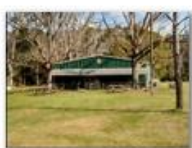
Activity Center (350 Capacity)