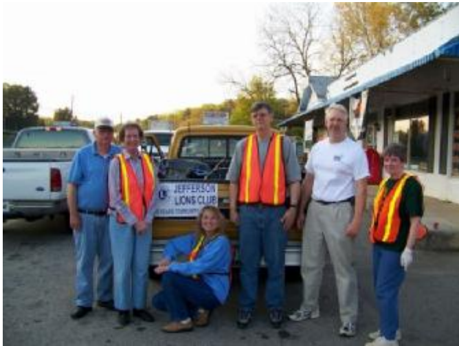
Lions day out Road Clean Up April 17th (6) Lions worked late Thursday evening.

Jefferson Lions Club = The Board of Directors met Monday March . 24th at Chili Dawgs . The BOD reviewed both completed and on-going and upcoming activities of the club. Finalized a date for the Fall Golf Tournament and emphasized the need for the full club to work to support the event by recruiting both players and hole sponsors. There will also be a called Board meeting of both the outgoing and incoming officers within the next two weeks.