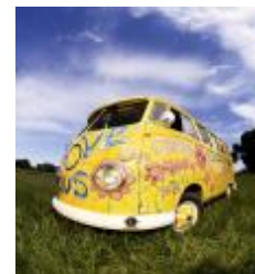
"Change the World"

We're the new generation of Lions. Join us today.