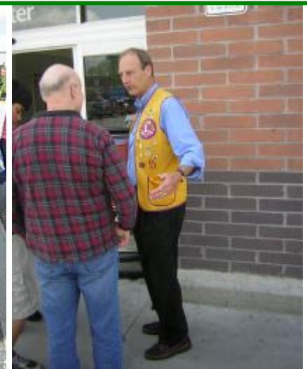
Norcross Lions Club is out and about trying to shake down many innocent bystanders in order to raise money for White Cane Day- amazing the people give.