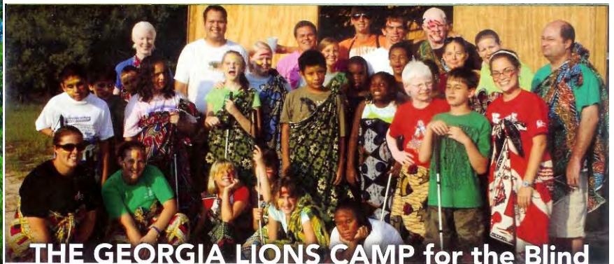
THE GEORGIA LIONS CAMP for the Blind