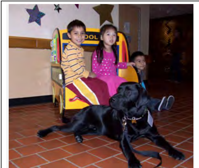
Chuckie poses with a few of the children that attend The Block Institute. Along with his brother Chester, the dogs have been a positive influence on both the students and the staff.