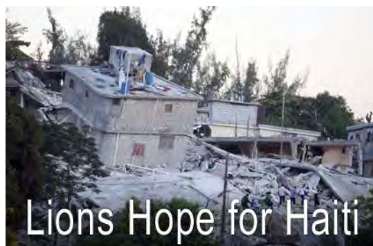
Al Brandel LCIF Chairperson

Currently, Lions are focused on immediate needs, such as shelter, food and water. But initial reports from the Lions of Haiti for long-term reconstruction focus on building a school and an ophthalmic clinic. This is similar to what Lions have been done for reconstruction following other catastrophes.