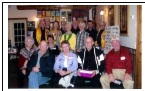
A successful meeting with eleven prospective members and Lions who spoke on various Lion related issues at Membership night