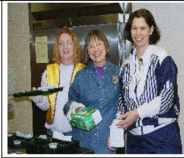
Toccoa Lions at work – February 23, 2008