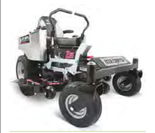
Dixie Chopper ZEE 2 with 48" deck Best residential grade zero turn riding lawn mower

Question raised. Annual Budget for the Camp this year is $310,000.00. Question raised about how much is left in the Trust Account. PDG Pat Pignataro reported that there was a little over $252,000.00 in the account; they planned to take out $40,000.00 to make available funds of $49,000.00 for the budget, as needed.