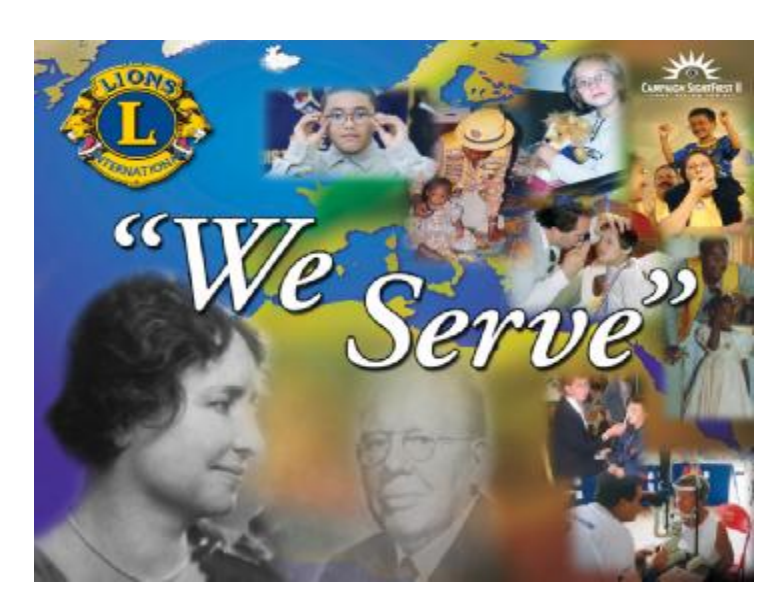
The KEY WORD to all of this is A S K Any further questions – just ask!