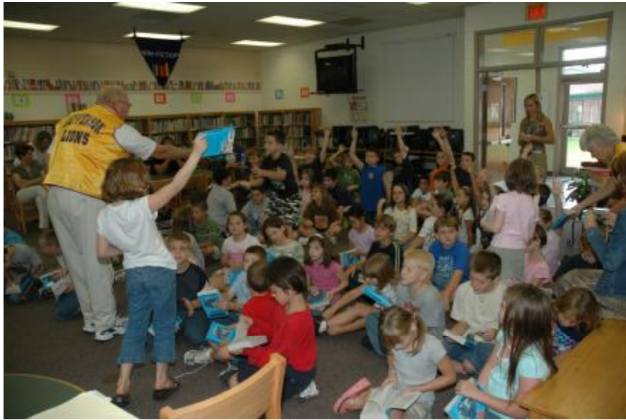
Jefferson Lions Club -

Here are several photos taken when members of the Jefferson Lions Club were handing out student dictionaries recently to 3rd graders at Maysville Elementary and Jefferson Academy.