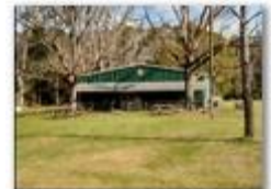
Activity Center Outside