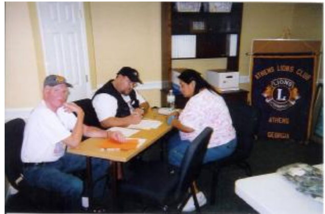
Lighthouse Vision Clinic at Athens at Mercy Health Clinic