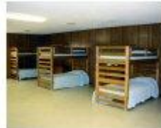
Inside of Dorm