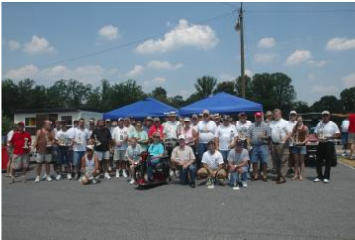
Jefferson Lions Club Annual Classic Auto Show winners