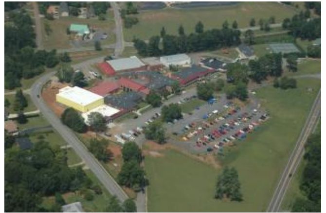
Aerial view of the Jefferson Annual Classic Auto Show

Busy! Busy! Busy! Food Fundraisers and a Health Fair have kept the Forsyth County Lions Club members very busy this summer.