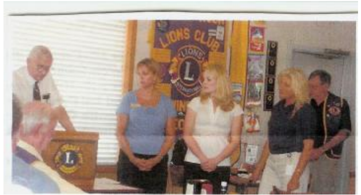
New members installed in the Winder Noon Lions Club.