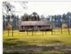
Arts & Crafts Building