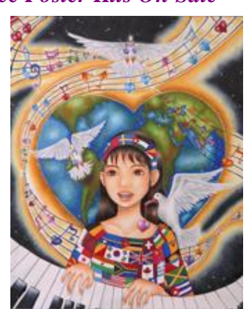
"Celebrate Peace" 2006-07 Grand Prize Winner

"Peace Around the World" is the theme of the 2007-08 Peace Poster Contest. Lions clubs can sponsor the program in their community for children in local schools or organized, sponsored youth groups. Students, ages 11, 12 or 13 on November 15, are eligible to participate. Through the contest, students are encouraged to visually depict