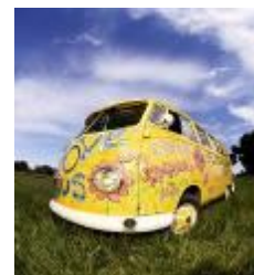
“Change the World”

Some of our projects include: Food drives, temporary shelter, health clinics, schools, vision screenings, affordable housing and environmental preservation.