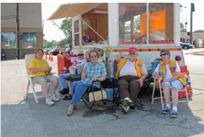
This is a group shot of Jefferson Lions relaxing for a few moments at the Freedom Festival Bake Sale just before the usual crowd of spectators and participants began to arrive.