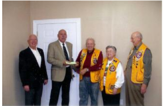
Lions present check to Alleghney Lodge 114 F&AM – another Lion project for past 10 years – This helps assist the Masons with their food baskets and boxes.